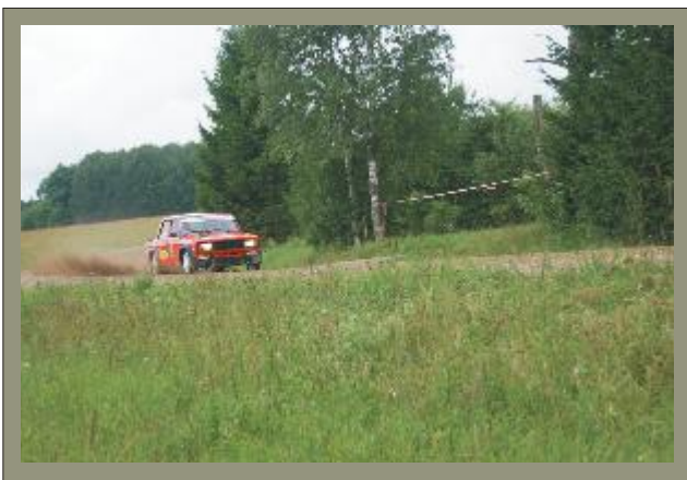
Always the crowd favorite and expected Dovilas Čiutelė