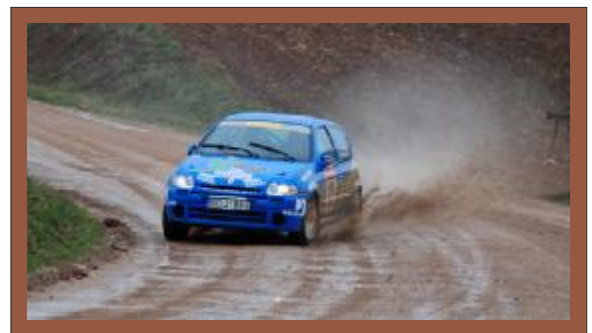
After a pause in the rally “Žemaitija” tracks return local crew Vilmantas Pupius and Gediminas Račas