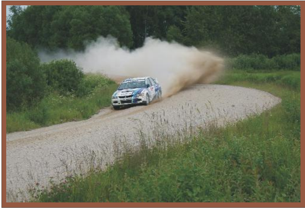
The winners of rally in Žemaitija tracks 2009, 2010, 2011 and 2013 years Vytautas Švedas and Žilvinas Sakalauskas